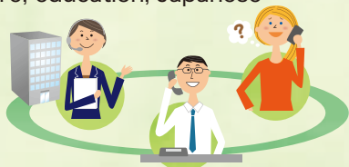
Three-way telephone interpretation

Residence status, work, healthcare, marriage, divorce, interpretation, translation, social insurance, pension, tax, housing, driving license, childbirth, childcare, education, Japanese language study, disaster management, international exchange, etc.